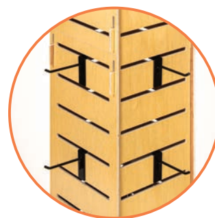
36 - 4" hooks included