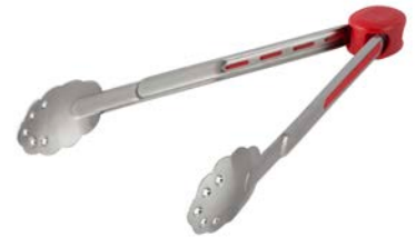
12.5" Stainless Steel Tongs

Punched teeth in pincer head prevents food from slipping.