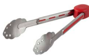
9.5" Stainless Steel Tongs

Tired of getting your fingers pinched while using tongs? Mobi Tongs will never pinch your fingers. Slide lock design prevents finger pinching. Extra wide pincers grab food easier.