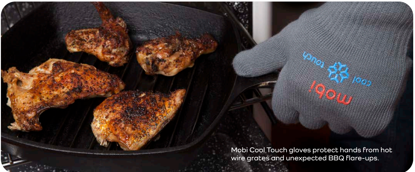
Mobi Cool Touch gloves protect hands from hot wire grates and unexpected BBQ flare-ups.